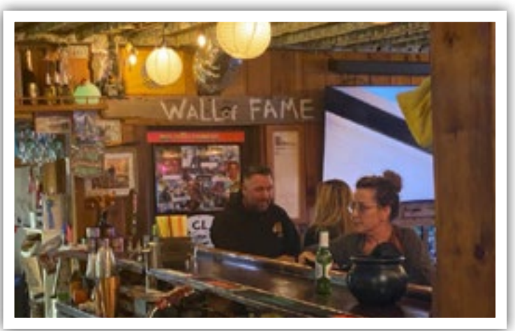
The Mohawk Tavern in Graeagle, California, was built in 1862 as a Wells Fargo stagecoach stop with overnight lodgings. Today, it's a bar and gathering point for locals.